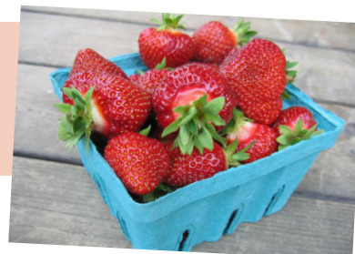
Delicious summer bounty

Sign-up and pay by March 31st and you'll also get free pick-your-own strawberry time in our fields!